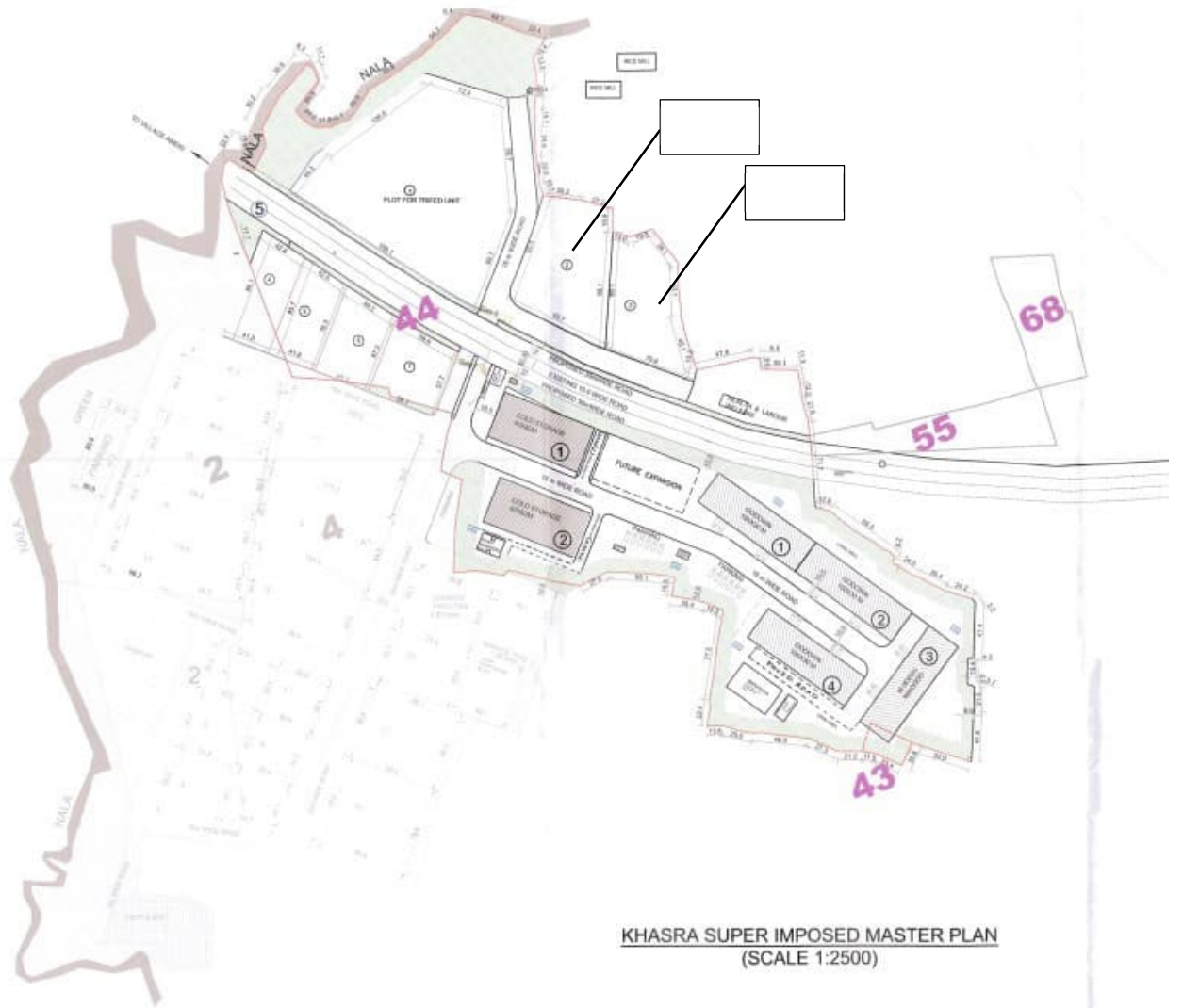
KHASRA SUPER IMPOSED MASTER PLAN (SCALE 1:2500)